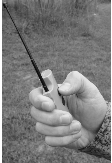
Figure 4 – Improper Orientation