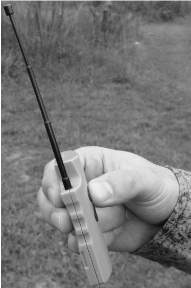
Figure 3 – Proper Orientation