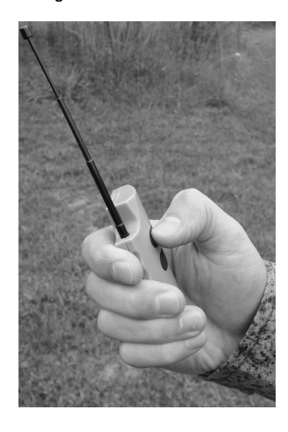
Figure 4 – Improper Orientation