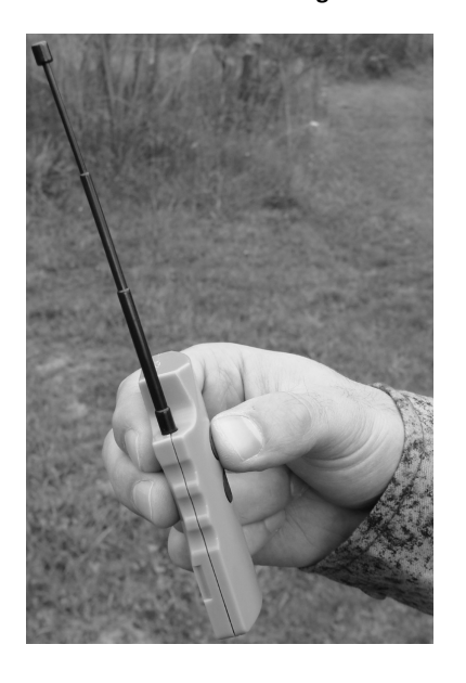
Figure 3 – Proper Orientation